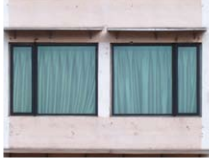
Window or Window Wall