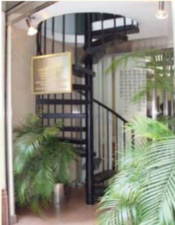
Internal Staircase and formation of slab opening