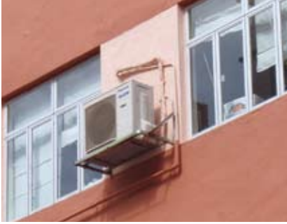
Supporting structures for air-conditioners and associated air ducts