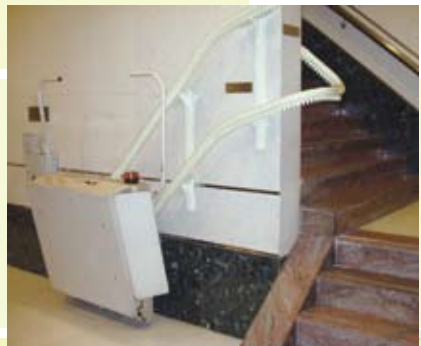
Building works associated with stairlift or lifting platform

For detailed descriptions and specifications of the minor works as mentioned above, please refer to the B(MW)R or visit the Buildings Department website at http://www.bd.gov.hk .