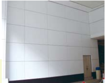
Panel fixed by metal dowels and fixings onto a wall inside a building