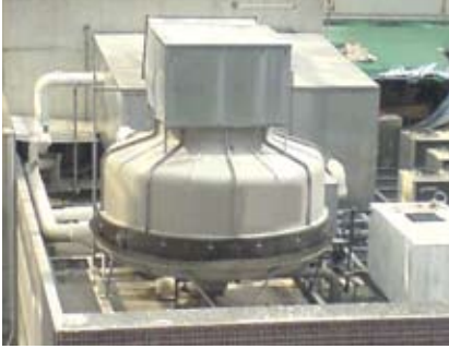
Supporting structures for water cooling towers and associated air ducts