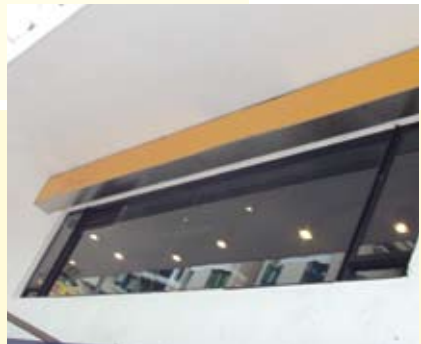
Window or Window Wall