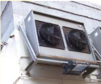
Supporting structures for air-conditioners and associated air ducts