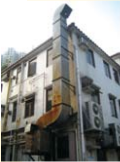
Removal of Chimney